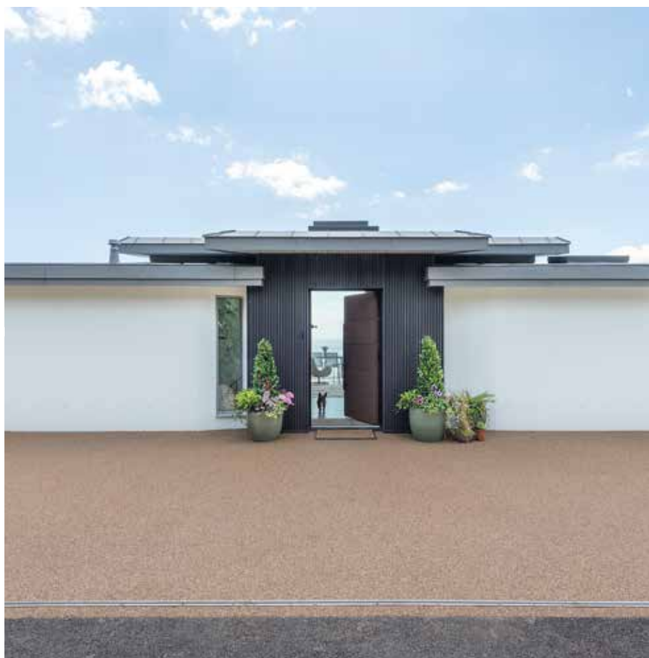
OPPOSITE To the rear, the house follows the cliff's contours, forming two glazed storeys designed to enjoy fabulous views through sliding glass doors. It has recently been named Local Authority Building Control Southwest regional winner for Best Individual New Home ABOVE LEFT Camilla and Andy Clark TOP LEFT & ABOVE RIGHT Built by Cedar Construction SW Ltd, the house's front façade appears low slung and unassuming, with rendered walls and comparatively small windows

A fter spending a winter enduring the freezing, damp dormer bungalow we'd bought as a holiday retreat in Devon, we realised that renovating the building might not be our best option,' recalls Camilla Clark of the detached cliff-top property she and husband Andy purchased in 2018. The couple had previously spent happy family holidays in Cornwall with their daughters, Mimi and Lara, now 25 and 28. 'That pull to the coast was always there,' says Andy, 'so we began looking at properties, hoping to find somewhere in Devon or Cornwall with a sea view, but never dreaming of anything as incredible as this.'