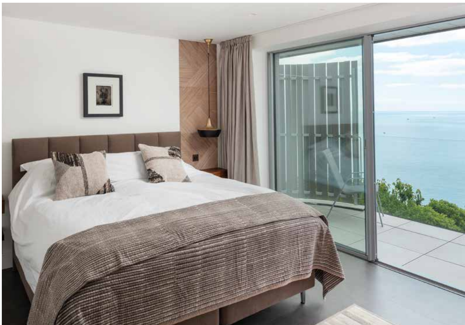
OPPOSITE A simple concrete staircase was installed, with the walls throughout the house painted in VOC-free paint from Little Knights. The house enjoys a spectacular cliff-top setting and the superb sea views can be admired while lazing in the hot tub ABOVE The master suite is the only first-floor bedroom, and wood-effect porcelain tiles were used to clad the wall on either side of the bed, to complement the copper drum lights

local walks and spend some time out on the water. 'We're not experienced sailors but decided to buy a RIB,' says Camilla. 'One day we spotted a huge pod of about 30 dolphins swimming towards us, and within seconds they were with us, riding the bow wave. We felt so honoured that they chose to play around us for an hour.'