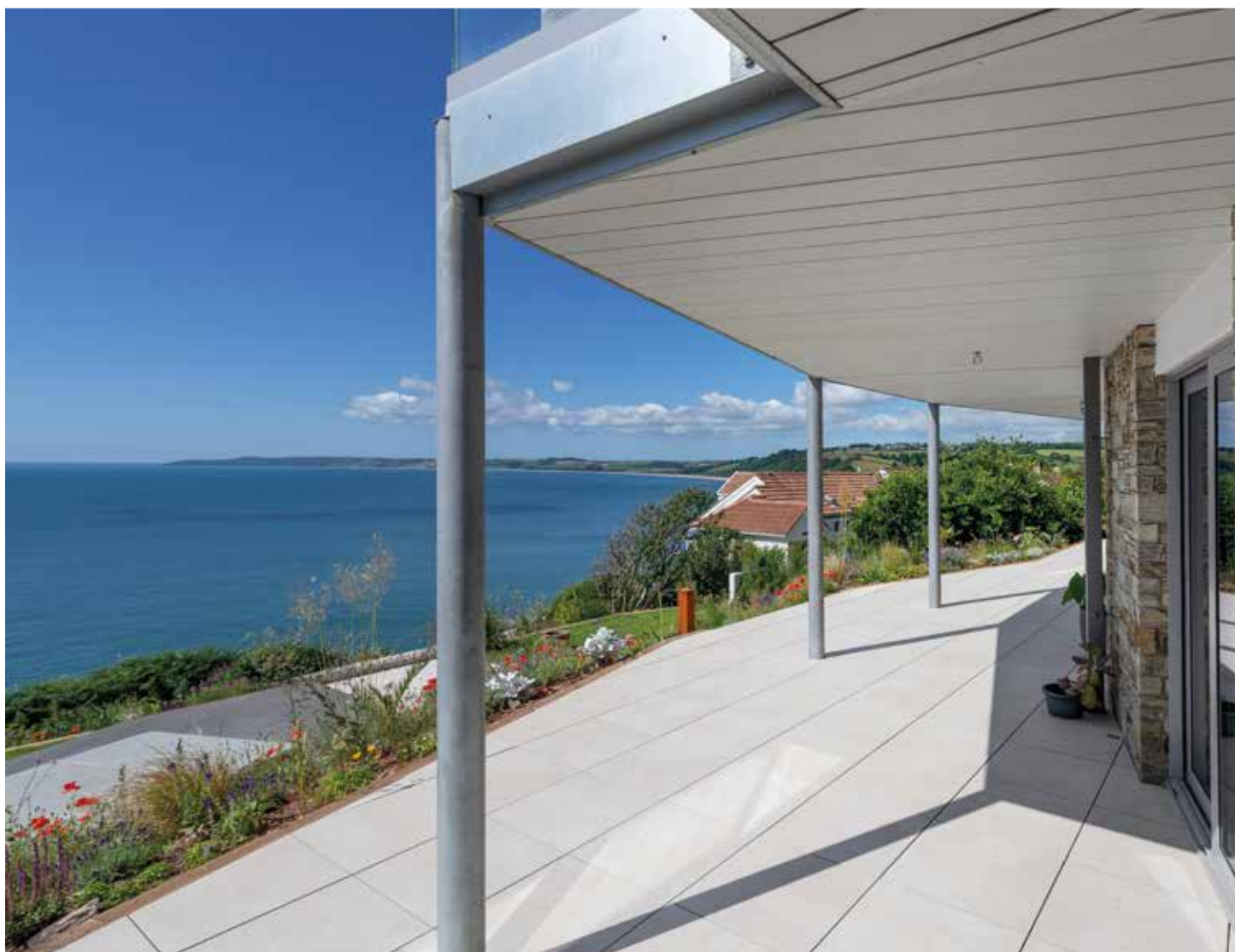
OPPOSITE A contemporary four poster bed stands in Mimi's ground-floor room ABOVE Instead of the grey tiles the couple had ordered, the Clarks received a consignment of sand-coloured tiles, which they chose to keep for the terrace and steps leading down to a plunge pool

the build, living in a caravan in a nearby holiday park in 2019, so that he could be on site daily. 'Camilla would travel down from our home in Somerset every weekend, and while I focused on the structural decisions, she took charge of the interior and garden design,' Andy explains.