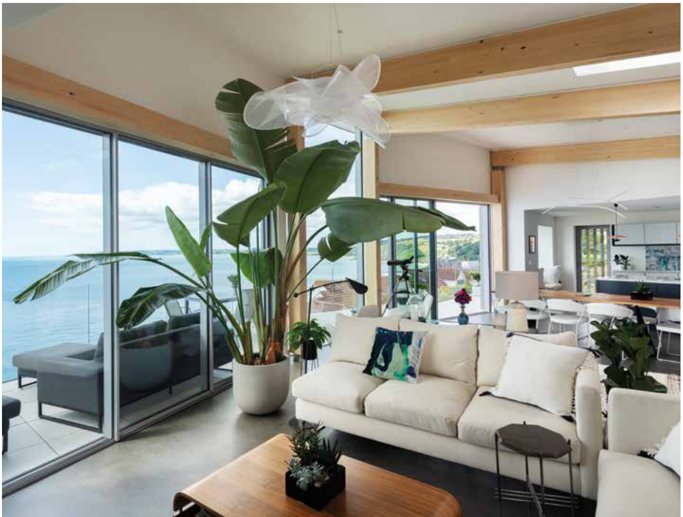
ABOVE Sofas from master upholsterer EcoSofa are made from FSC-certified timber and a range of natural materials with no toxic chemicals as Camilla is allergic OPPOSITE & ABOVE The open-plan living/dining/sitting room on the first floor enjoys 180° views from the wraparound balcony and through glass doors BELOW The kitchen features a striking bespoke splashback, made by local company Custom Splashbacks, from a picture of one of Camilla's coastal paintings

the house, using a torch to track the path of the sun into rooms, so that we could really understand how it might feel.'